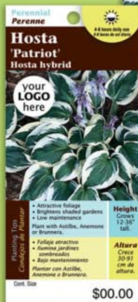
Small Nursery Tag (actual size: 2 x 4 1 / 2 "")